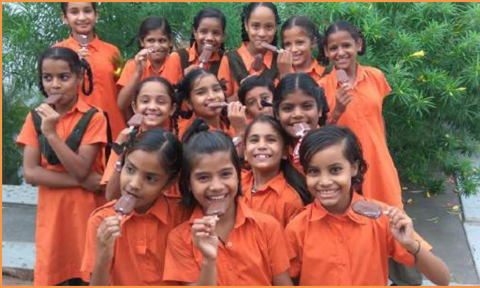
Ice Cream Day organized by Sysnet Global Technologies Pvt. Ltd. on 14 th July