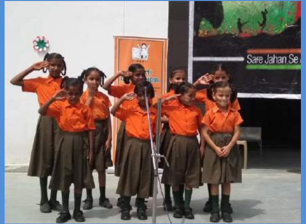
Independence Day 15 th August