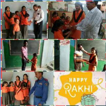
Rakhi 25 th August