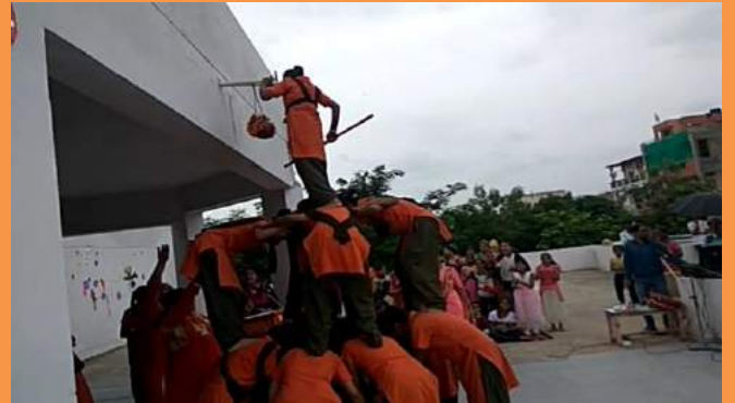
Janamashtami 1 st September