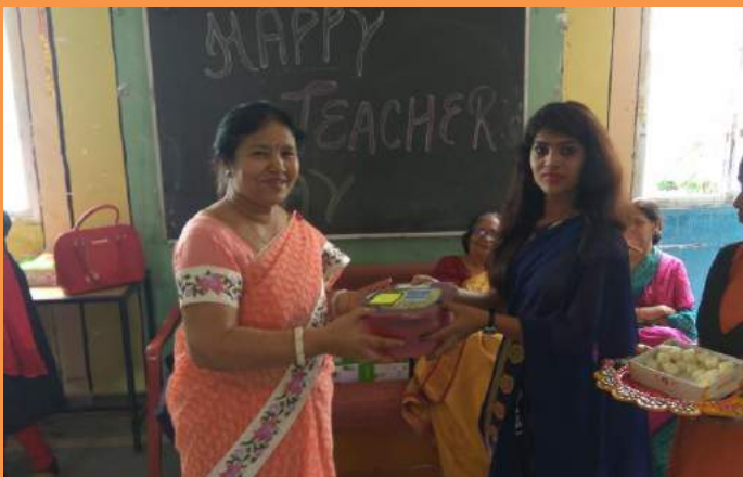
Teachers Day 5 th September